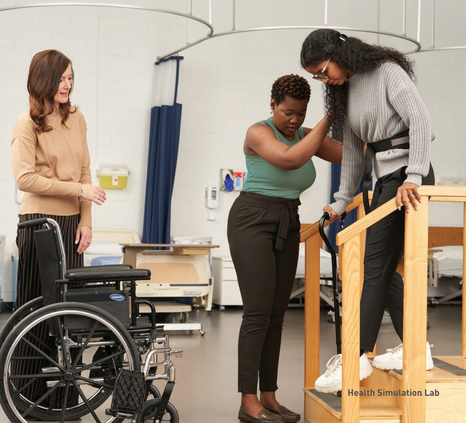
Health Simulation Lab

Small class sizes and a dedicated cohort create a tight-knit community and strong relationships with your peers and instructors that will last well after graduation. Hands-on learning and modern simulation labs provide immersive experiences that mirror real-world work environments.